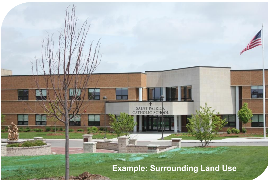
Example: Surrounding Land Use

Land Use: Institutional/Low Density Residential. Mobility Connections: A local road is necessary along the southern property boundary to allow for a secondary access for the property adjacent to the east (Subarea 2C). Special Facilities: None identified. Environmental Considerations: None identified.